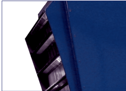
Constant airflow covering the entire web width