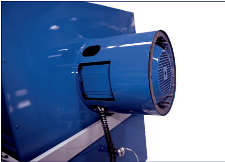
Compact design and high drying efficiency