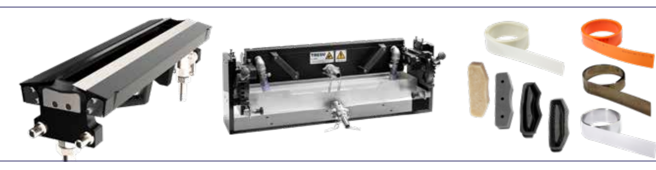
TRESU chamber doctor blade systems and proven doctor blades